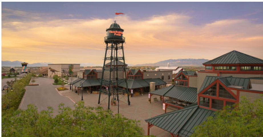
Thanksgiving Point is a large complex with shopping, 2 museums, event space and other attractions