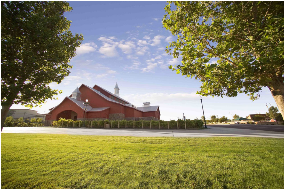
The Show Barn at Thanksgiving Point - Easy Access