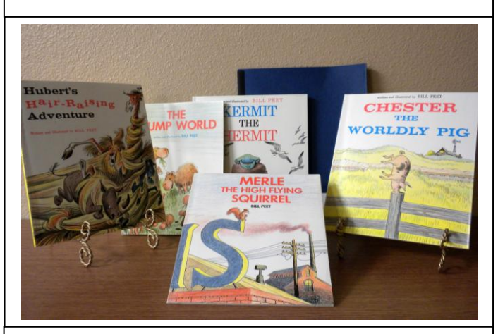
Merle the high flying squirrel Hubert's Hair Raising Adventure Kermit the Hermit Chester the World Pig The Wump World