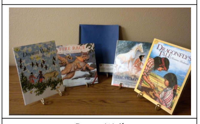
Dream Wolf Fire Race The Mud Pony Dragonfly's tale