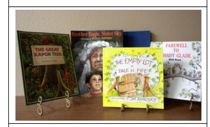
The Empty Lot The Great Kappk Tree Brother Eagle Farewell to Shady Glade