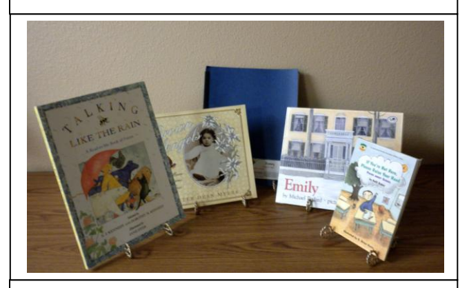
Colors of the Rainbow