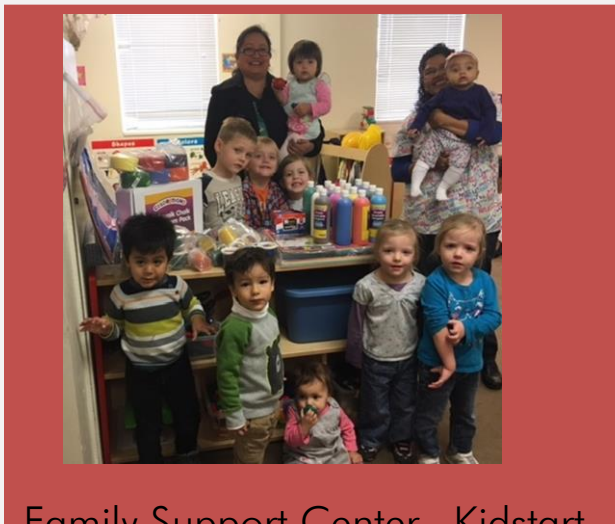
Family Support Center– Kidstart $200 Basket Winner