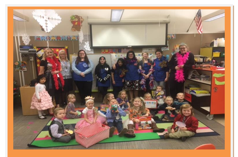
Taylorsville High School Preschool $150 Basket Winner