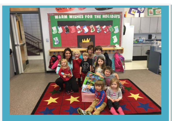
Jordan High School Child Care Lab $100 Basket Winner