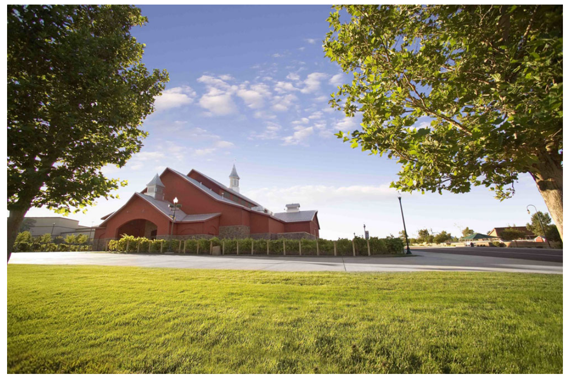
The Show Barn at Thanksgiving Point - Easy Access