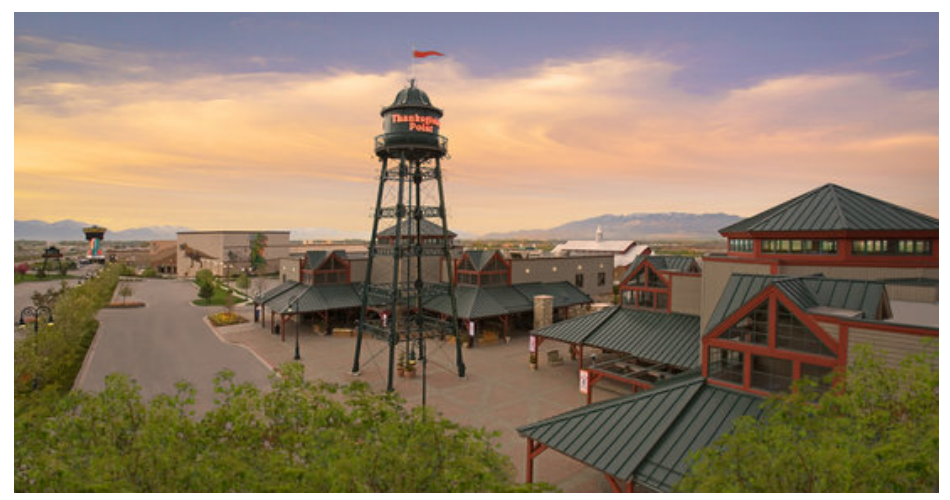
Thanksgiving Point is a large complex with shopping, 2 museums, event space and other attractions