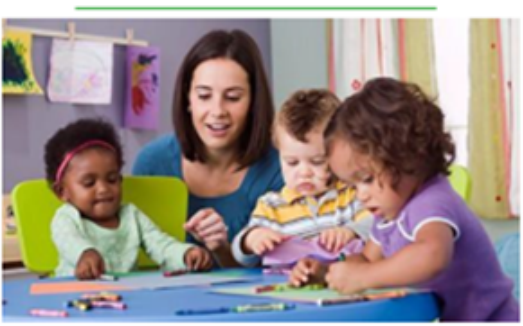
Creating a professional, educated and fairly compensated early childhood work force

Licensed Center or Family Child Care Program