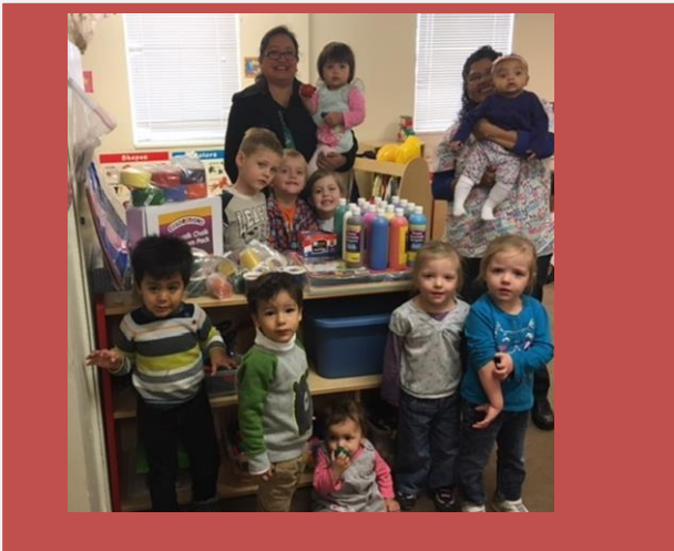
Family Support Center– Kidstart $200 Basket Winner