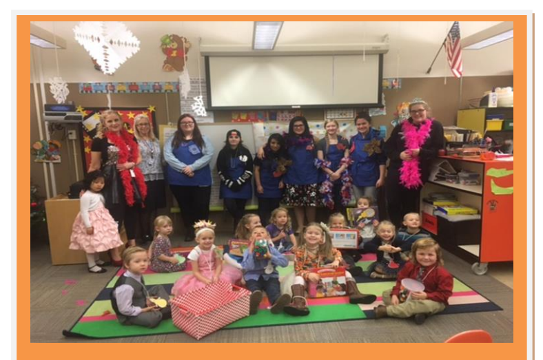
Taylorsville High School Preschool $150 Basket Winner