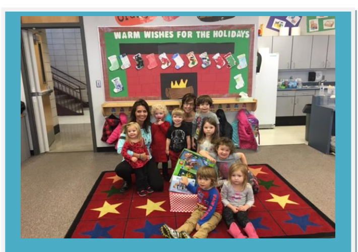
Jordan High School Child Care Lab $100 Basket Winner