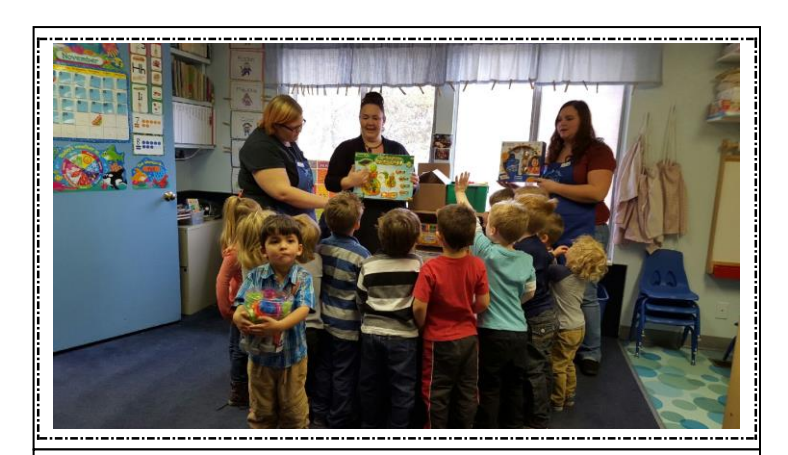
Children's Corner #1 $100 Basket Winner