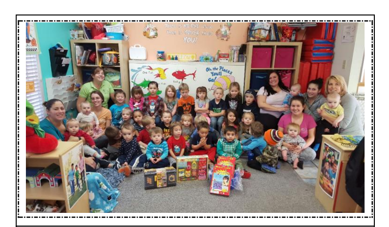
Bear Essentials Academy $75 Basket Winner