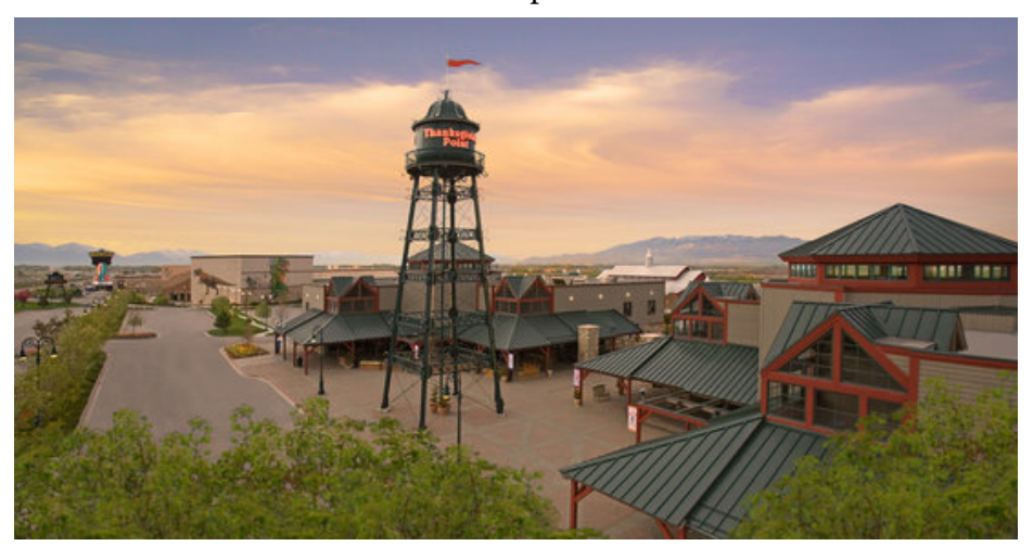
Thanksgiving Point is a large complex with shopping, 2 museums, event space and other attractions